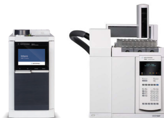
Agilent Intuvo 9000 GC and Agilent 7697A headspace sampler.

For more information, visit: www.agilent.com