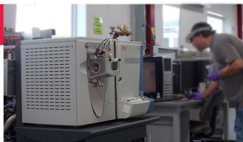
Refurbishment to Manufacturer's Standards

Technicians then conduct in-depth cleaning, detector maintenance and line and pump flushing—essentially wiping the instrument's slate clean. Routine maintenance is then executed, replacing liners, filters, tubing, etc. This step in the process restores our refurbished laboratory equipment to industry standards for your operation.