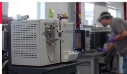
Refurbishment to Manufacturer's Standards

Technicians then conduct in-depth cleaning, detector maintenance and line and pump flushing—essentially wiping the instrument's slate clean. Routine maintenance is then executed, replacing liners, filters, tubing, etc. This step in the process restores our refurbished laboratory equipment to industry standards for your operation.