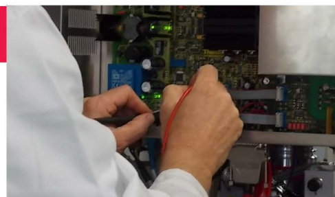
Perform Full Product Calibration and Data Verification

GenTech Scientific runs industry-approved standards on your instrument to verify that the chromatography results are accurate within accepted specifications, and that these results are reliably reproducible. Any necessary adjustments are made to the instrument until it meets specifications. If you are using your own data collection system, we also verify and ensure that your instrument arrives firmware-compatible. GenTech provides customers with printed data to verify the quality measurements being identified.