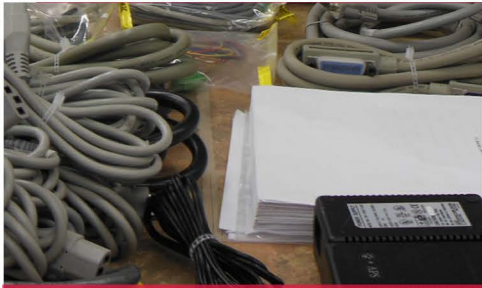
Provide User Manuals and Accessories