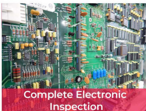
Complete Electronic Inspection