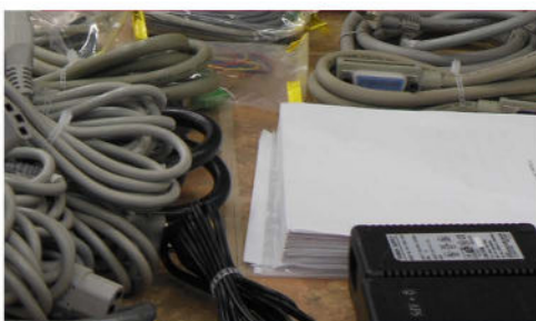
Provide User Manuals and Accessories