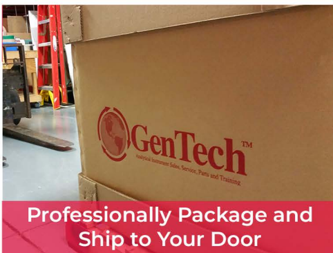
Professionally Package and Ship to Your Door

As these refurbished analytical instruments have been pre-owned they may exhibit some wear. We do our best to remove most cosmetic imperfections such as scratches, marks, and discolorations. At this step in the process, each instrument is also given a very detailed appearance quality control inspection.