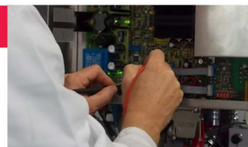
Perform Full Product Calibration and Data Verification

GenTech Scientific runs industry-approved standards on your instrument to verify that the chromatography results are accurate within accepted specifications, and that these results are reliably reproducible. Any necessary adjustments are made to the instrument until it meets specifications. If you are using your own data collection system, we also verify and ensure that your instrument arrives firmware-compatible. GenTech provides customers with printed data to verify the quality measurements being identified.