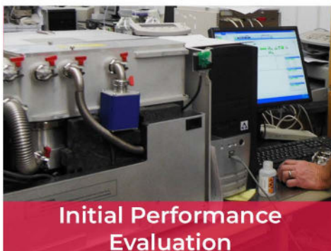
Initial Performance Evaluation

Our skilled and experienced technicians assist you with custom system configuration fit to your lab's specific needs. They are also ready to help you identify issues you currently face with existing equipment, and offer new, customized solutions to help your lab reach and exceed goals. All at a fraction of the costs of new equipment.