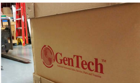
Professionally Package and Ship to Your Door

As these refurbished analytical instruments have been pre-owned they may exhibit some wear. We do our best to remove most cosmetic imperfections such as scratches, marks, and discolorations. At this step in the process, each instrument is also given a very detailed appearance quality control inspection.