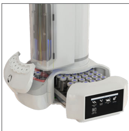
Vial unloading after conditioning