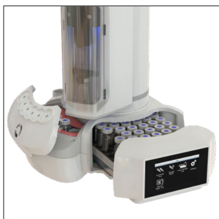
Vial loading in the oven